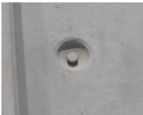
Image of pin head lift

Choose the best unloading / installing equipment (telehandler, forklift, crane or crane truck etc) for your job. Coordinate and book your chosen installation equipment, factory pick up and transport, early. Chains & Jib.