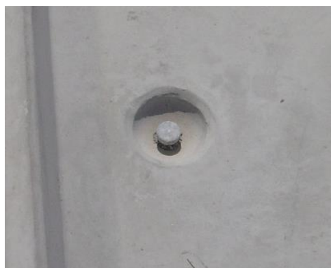
Image of pin head lift

Choose the best unloading / installing equipment (telehandler, forklift, crane or crane truck etc) for your job. Coordinate and book your chosen installation equipment, factory pick up and transport, early. Chains & Jib.